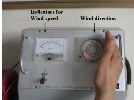
Fig 3a: EL Anemometer, Sensor (Outdoor)