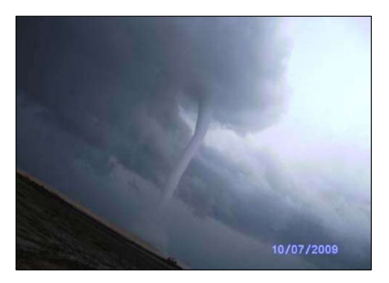
Fig 2: A tornado occurred at Thi Vai Harbor, 10 July 2009

- Topographical winds: Many locations in mountainous areas were subject to down-slope winds. The native people call them "Lao-wind" on the east side of the Truong Son mountain ridges Vietnam-Laos border, "Than Uyen-wind" in Than Uyen-Dien Bien province and "Oquiho-wind" in Sa Pa-Lao Cai province, etc. (http://www.thoitietnguyhiem.net/).